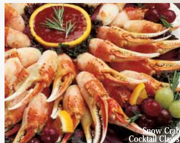
Snow Crab Cocktail Claws